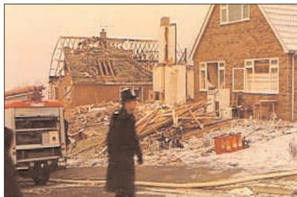
The decimated scene of a gas explosion - only the chimney breast of the house remains

Needless to say, our focus on maintaining Health and Safety is unwavering; we review our procedures and results constantly to ensure that the well being of our people, customers and anyone else affected by what we do is always the foremost consideration of all our activities.